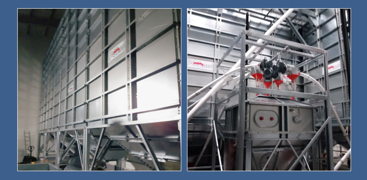
SPIRAL CASCADE FOR GENTLE FEED AND PELLETS TREATMENT